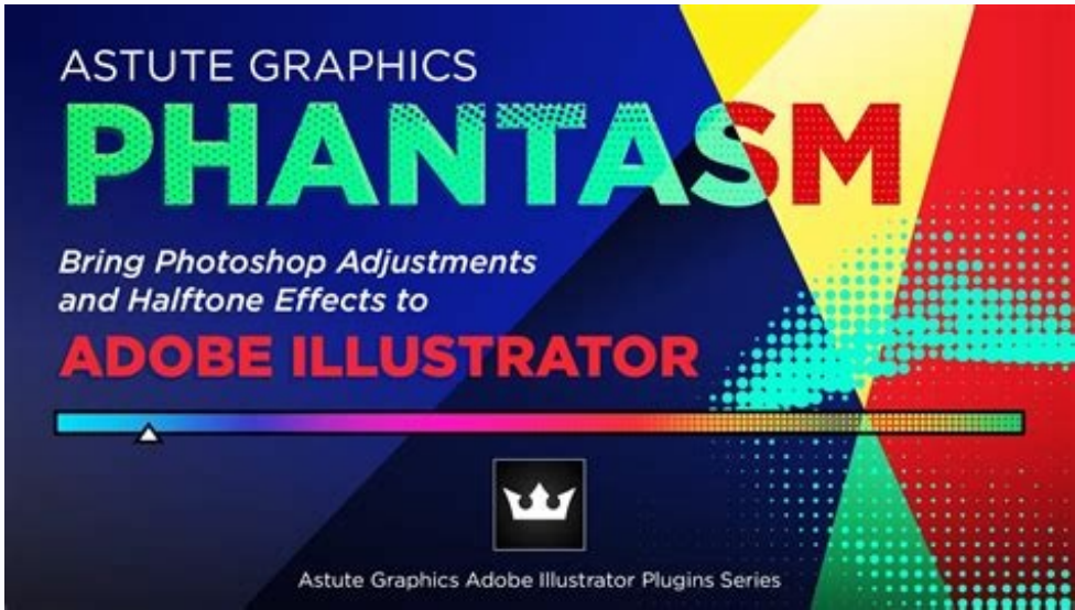
Astute graphics plugin.