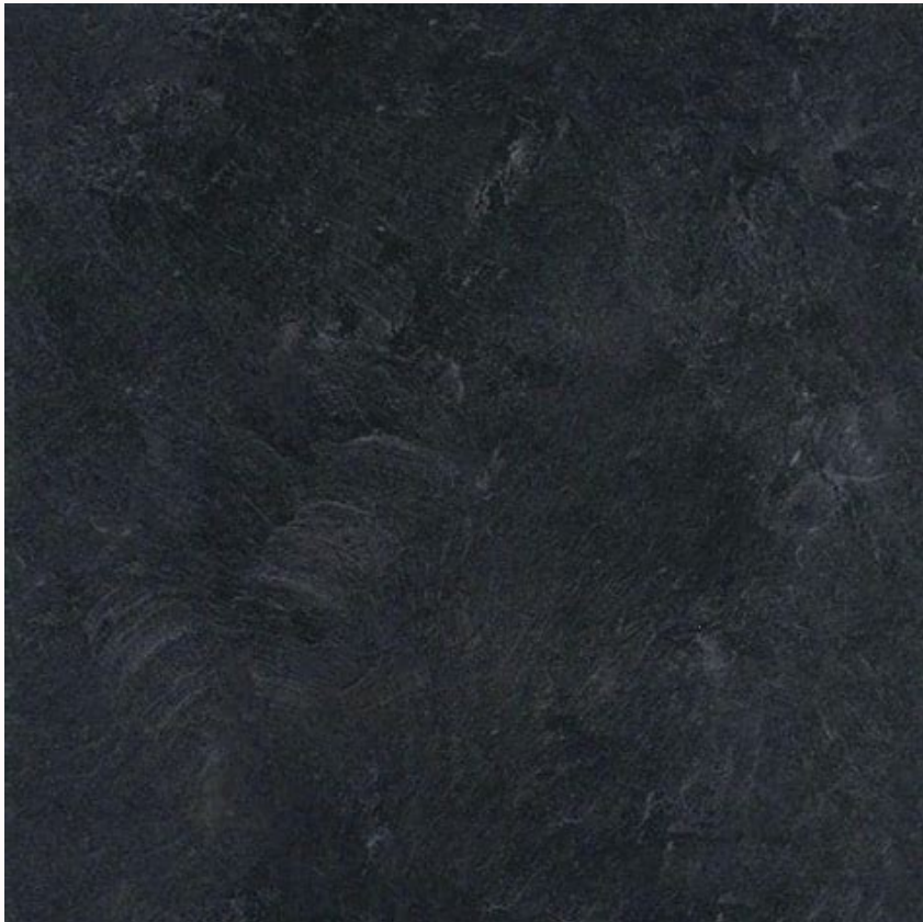
Natural slate vs composite slate. How durable is slate countertops. Slatron vs slate.